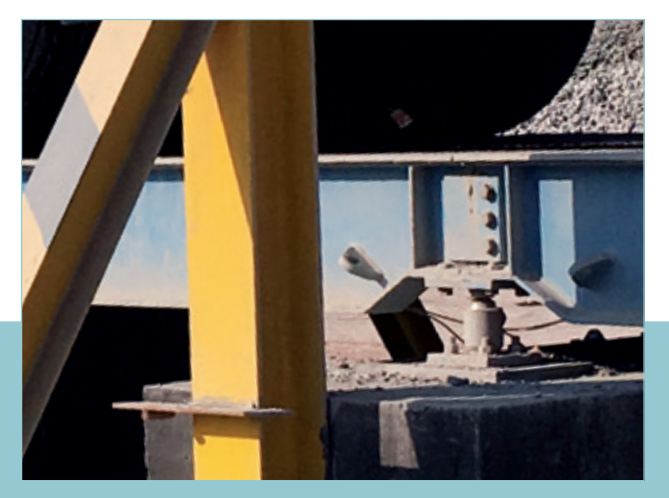
The truck scale load cell PR 6221 guarantees precise measurement results, a long product lifetime and exceptional reliability