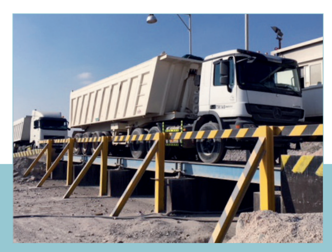
Highly durable truck scales are required for the extreme conditions at the United Arab Emirate of Fujairah

Minebea Intec partner Danway Emirates installed a truck scale at the crusher plant from 2015 to 2017, which runs approximately 140,000 single weighings per year. The scale consists of a platform of 18 x 3 metres equipped with 10 load cells of 30 t, amounting to a capacity of 300 t. The truck scale is calibrated by Danway Emirates every twelve months and its accuracy is just as spot-on as on day one. All results meet the OIML Class III requirements.