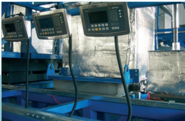
Combics 3 weight indicators' large displays provide excellent visible readout even in unfavourable conditions