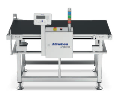
Checkweighers for heavy loads