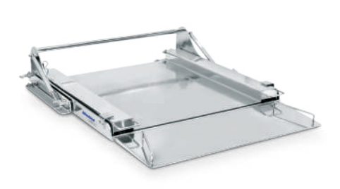
Weighing of incoming goods