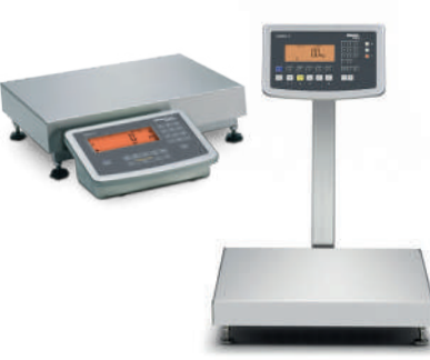
Portioning and checkweighing