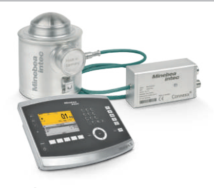
Components and solutions for vehicle weighing (analogue/digital)