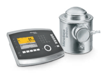
Components and solutions for vehicle weighing (analogue/digital)