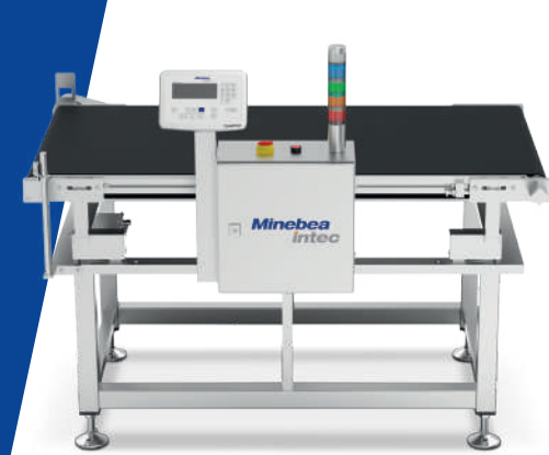
Essentus® H efficiency