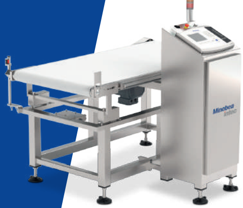
Essentus® H performance

Scan the QR code and learn more about the benefits and combinations of Essentus®