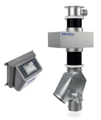
Foreign object detection (metal detection/X-ray inspection)